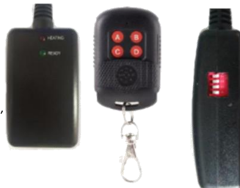
Wireless Remote Control Set (With 4 Channel Dip Switch)

When the heating process is finished, the green light lights up and indicates that the button on the remote control can be pressed. If heating is not complete, the green light does not light up and the red light is on, then the remote control cannot be operated. 4 channels can be selected, suitable for 1,2,3,4, if only 1 channel is used, the others are closed. frequency 315MHz