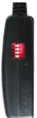
Wireless Remote Control Set (With 4 Channel Dip Switch)