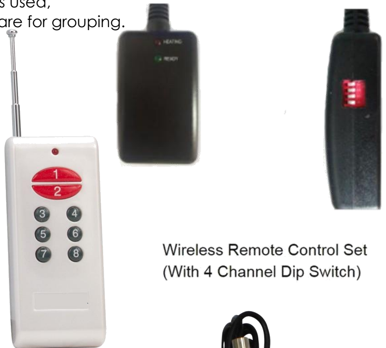
Wireless Remote Control Set (With 4 Channel Dip Switch)